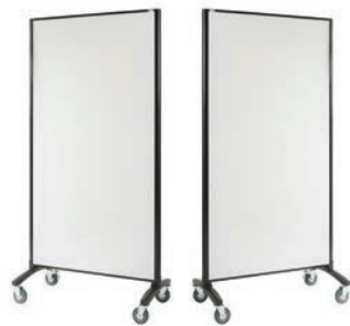
Whiteboard / Whiteboard