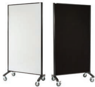
Whiteboard / Pinboard