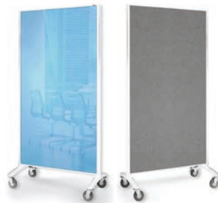
Blue Glassboard / Pinboard