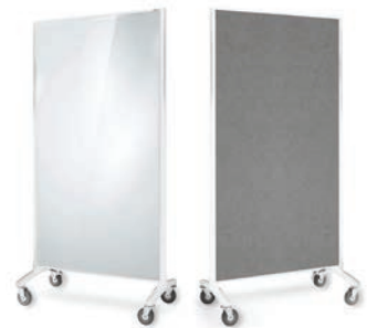
White Glassboard / Pinboard