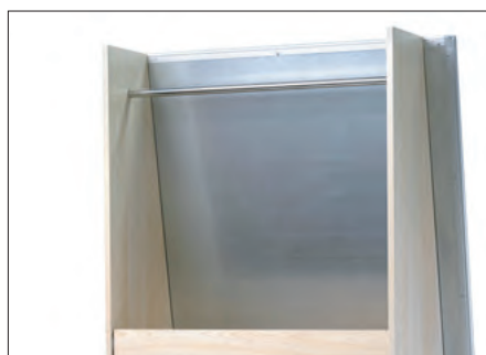
Hanging Back Storage