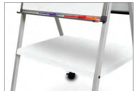
Pen & Storage Tray