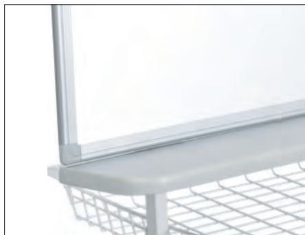
Whiteboard & Ledge