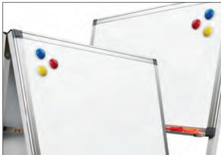
Double Sided Porcelain Whiteboard