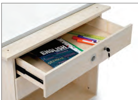
2 x Storage Draws, 1 is Lockable

FREIGHT CHARGES MAY BE APPLICABLE IN SOME REGIONAL AREAS