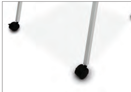
Locking Castor Wheels