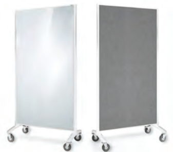
White Glassboard / Pinboard