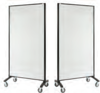
Whiteboard / Whiteboard