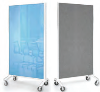
Blue Glassboard / Pinboard