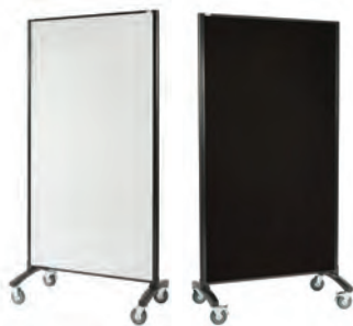
Whiteboard / Pinboard